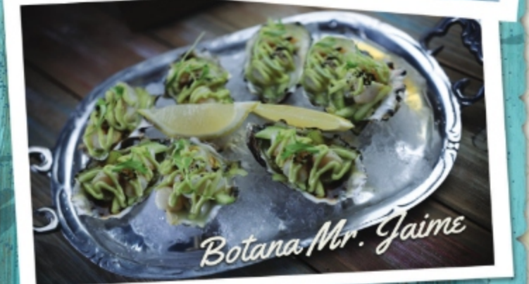
Botana Mr. Jaime

Mussels 41.99 20 Mussels marinated and fried with the special recipe of the house. Garnished with orange and cucumber slices.