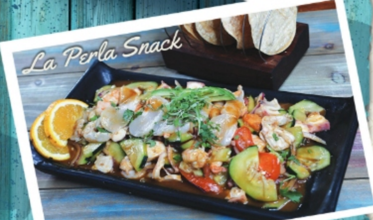
La Perla Snack

* Del Mar Tower 39.99 Tower made of cook shrimp, aguachiles, octopus, ceviche, onion, tomato and cucumber bathed in culichi sauce. garnished with slices of avocado and served with 3 fried shrimps and cumber with chile tajin.