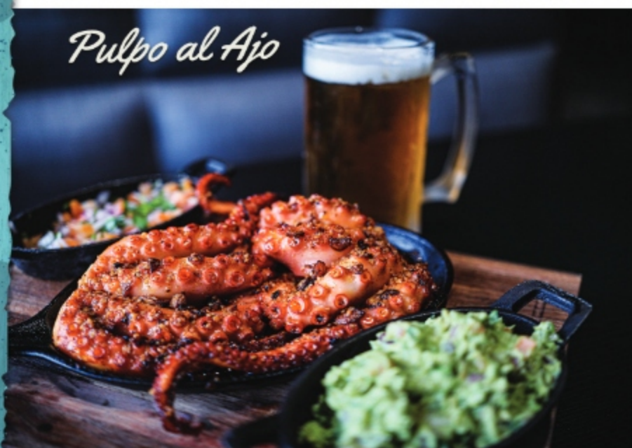
Pulpo al Ajo