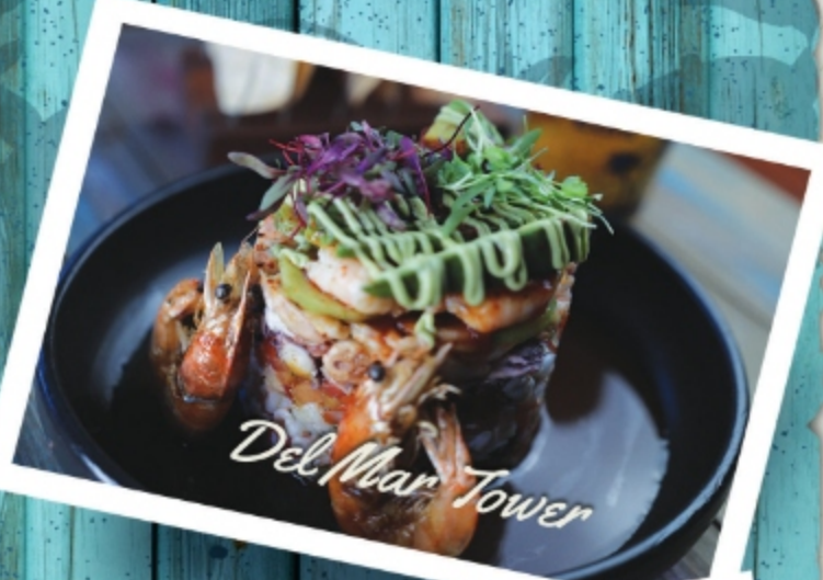
Del Mar Tower

* Del Mar Tower 39.99 Tower made of cook shrimp, aguachiles, octopus, ceviche, onion, tomato and cucumber bathed in culichi sauce. garnished with slices of avocado and served with 3 fried shrimps and cumber with chile tajin.