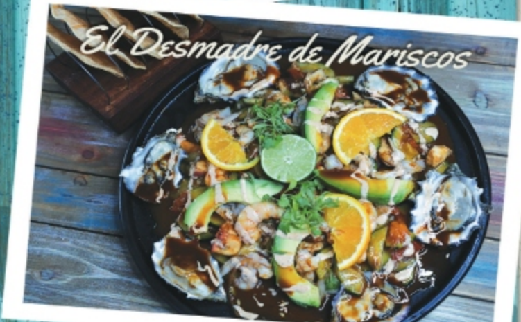
El Desmadre de Mariscos

* El Desmadre de Mariscos Snack 44.99 A combination of aguachiles, cooked shrimp, ceviche, octopus, oysters, in its shell, tomato, onion, and cucumber, garnished with slices of avocado and lemon.